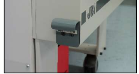
Storage space for 1 die