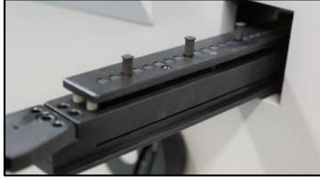
Wide range of quality punch dies with removable pins