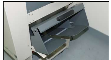
Reception with capacity up to 100 mm (2 reams ~ 1,000 sheets)