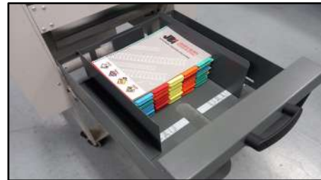
Retractable reception allowing easy handling of punched sheets