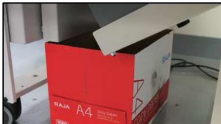
A standard carton for reams of A4 paper can be used as a confetti bin