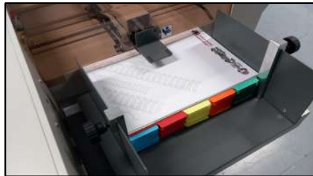
Adjustment of the feeder with magnetic and sliding stops