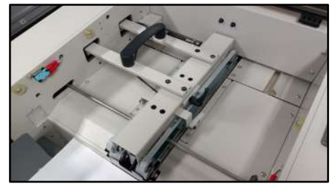
Proven technology from DocuPunch® PLUS