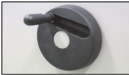
Easy format set-up with simple hand wheel activating the side lay gauges of the central transport unit