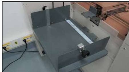
Feeder with capacity up to 100 mm (2 reams ~ 1,000 sheets)