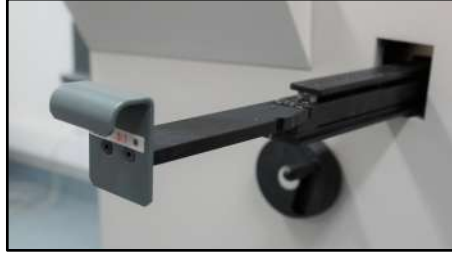
Easy die change in less than 2 minutes