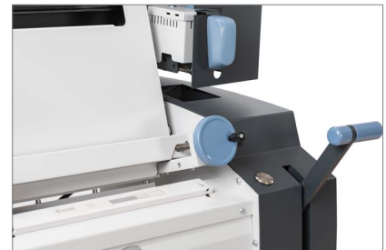
Ergonomic handles and sturdy rail for constant quality.