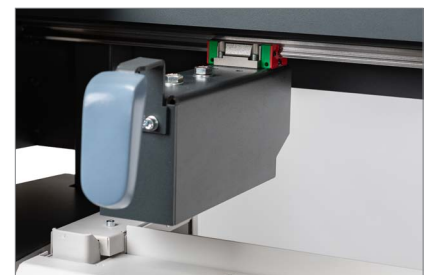
Optional PGO Gen 5 roughener: spine preparation for difficult papers