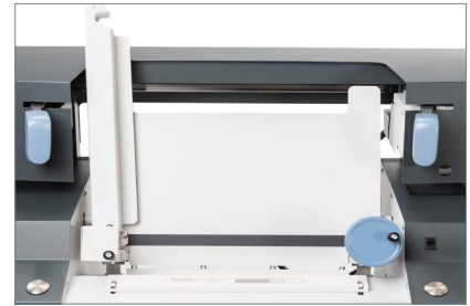
New Sesame system for better access to the book block

Product information as of June 2024 and is subject to change without notice