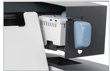
Safe construction. No risk for fingers in the rollers.