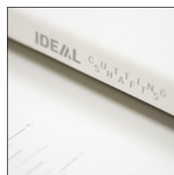
cutting section quality (Krug + Priester cutting knives)