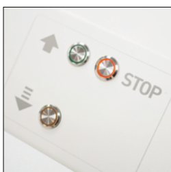
intuitive REVERSE / QUICK STOP control panel