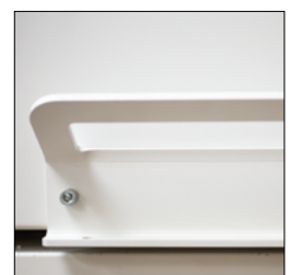
robust powdercoated housing, carrying handles