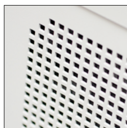
builtin thermal protection (dust protection)